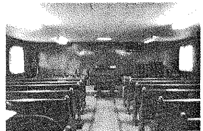
Interior of the South Bend Mission.

A special thanks to the tireless efforts of the Ohio District Mission Board, and the brothers and sisters of the Ohio District for their prayers and endeavors on our behalf.